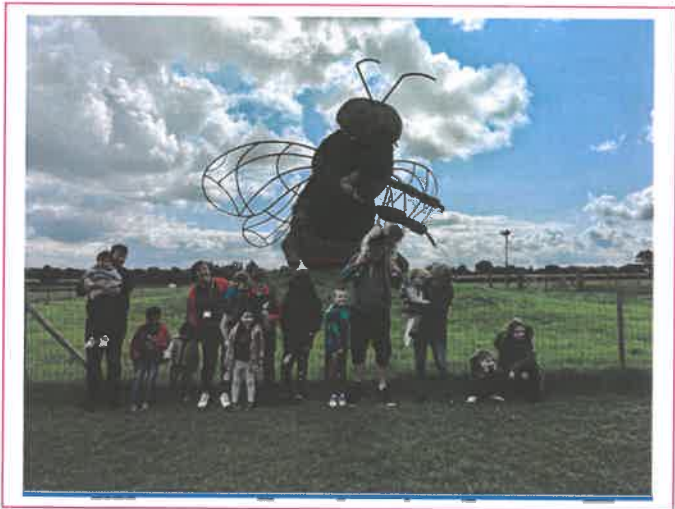
Ice creams all round at Snugburys!