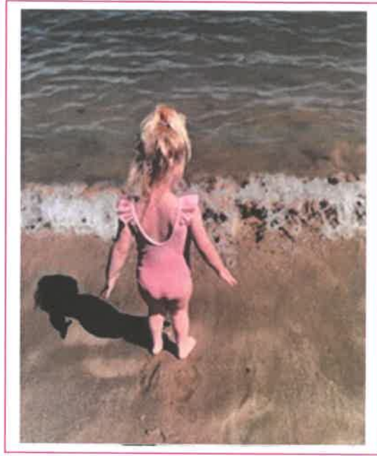
Padding in the sea at Llandudno