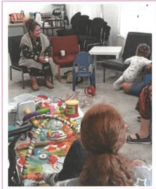
Mums and tots at coffee & chat