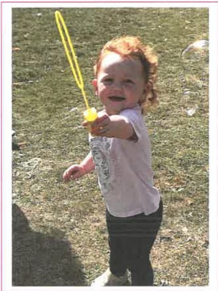
Fun and games in Queen's Park