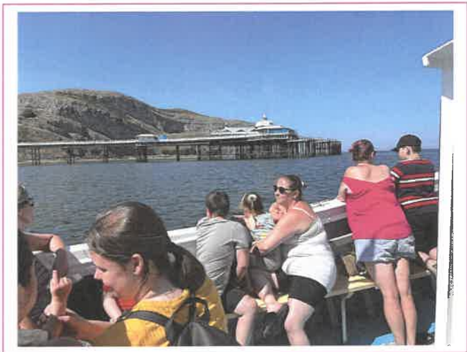
Wonderful sunny day for our trip to Llandudno, funded by a generous donor